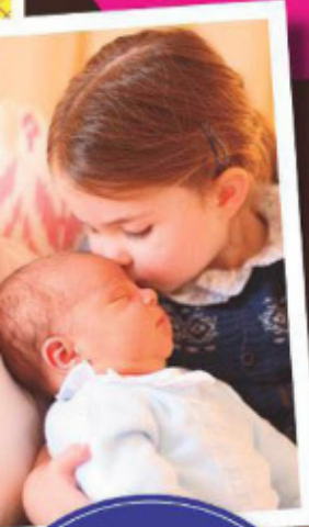
ROYAL PHOTO ALBUM